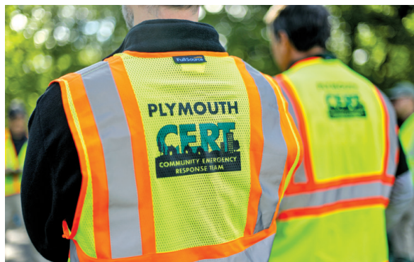
Plymouth is looking for new volunteer members to join the Community Emergency Response Team.

In addition to completing the CERT volunteer application, eligible candidates must live or work in Plymouth, have a high school degree or equivalent, be at least 21 years old, have a valid Minnesota driver's license and pass a criminal