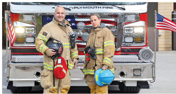
Plymouth is recruiting part-time/on-call firefighters. Applications are accepted May 13 through June 30.

In addition to responding to medical and fire calls, Plymouth firefighters provide public education in schools, homes, businesses and community organizations. They serve others, learn lifelong skills and build friendships. Part-time/on-call firefighters earn an hourly wage for all on-duty activities, including training. They are partially vested for a pension after five years of service, and can defer wages to a qualified