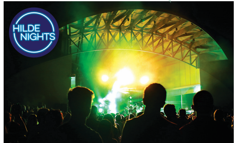
Hilde Nights is a new free entertainment series from the City of Plymouth.