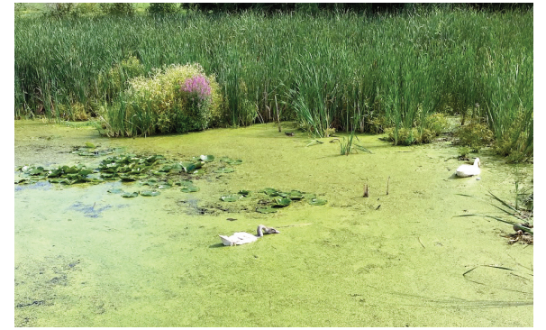
Despite its appearance, Lake Camelot offers a high-quality habitat for fish, turtles, swans, ducks and more.

Plymouth Boulevard project timing is subject to change due to construction activities and weather. The city appreciates the patience of area residents, businesses and motorists during construction. To view detour maps and more information, visit plymouthmn.gov/plymouthblvd .