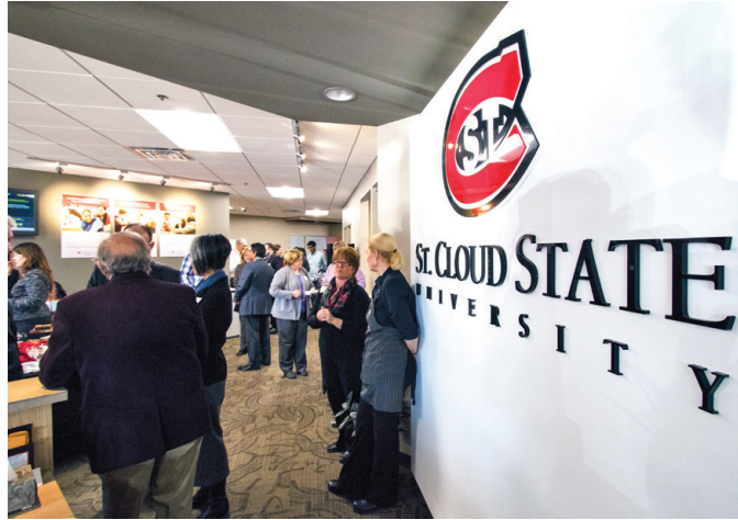
St. Cloud State University has a satellite campus in Plymouth that offers a range of courses, including medical technology programs.

In other business news, Rock Elm Tavern , located at 16605 County Road 24, is expanding into the area next door to add the Clubhouse – an event space featuring three multi-sports simulators for golf, hockey, soccer and more.