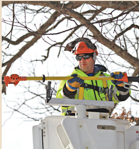
Annual trimming of city boulevard and park trees is set to occur in the northeastern part of the city this year.

Ostvig Tree, Inc. will trim boulevard trees for street clearance and removal of hazardous and/or dead limbs. Trimming begins in February and is expected to last through March or April – focusing on the northeastern area of Plymouth.