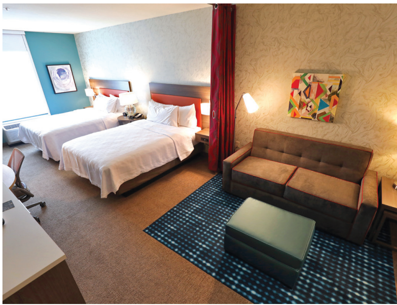
The DMO is geared towards attracting visitors to Plymouth and is funded by the city's lodging tax, which is collected during hotel stays when visitors rent a room.

At press time, following a request-for-proposals process, the city was finalizing a contract with a Minnesota-based advertising agency to develop a new name and brand for the DMO. The new brand will be announced later in 2024.