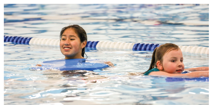
Plymouth offers new pool programs at Wayzata East Middle School.