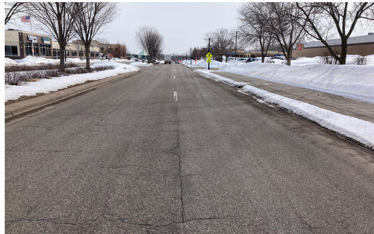
36 th Avenue