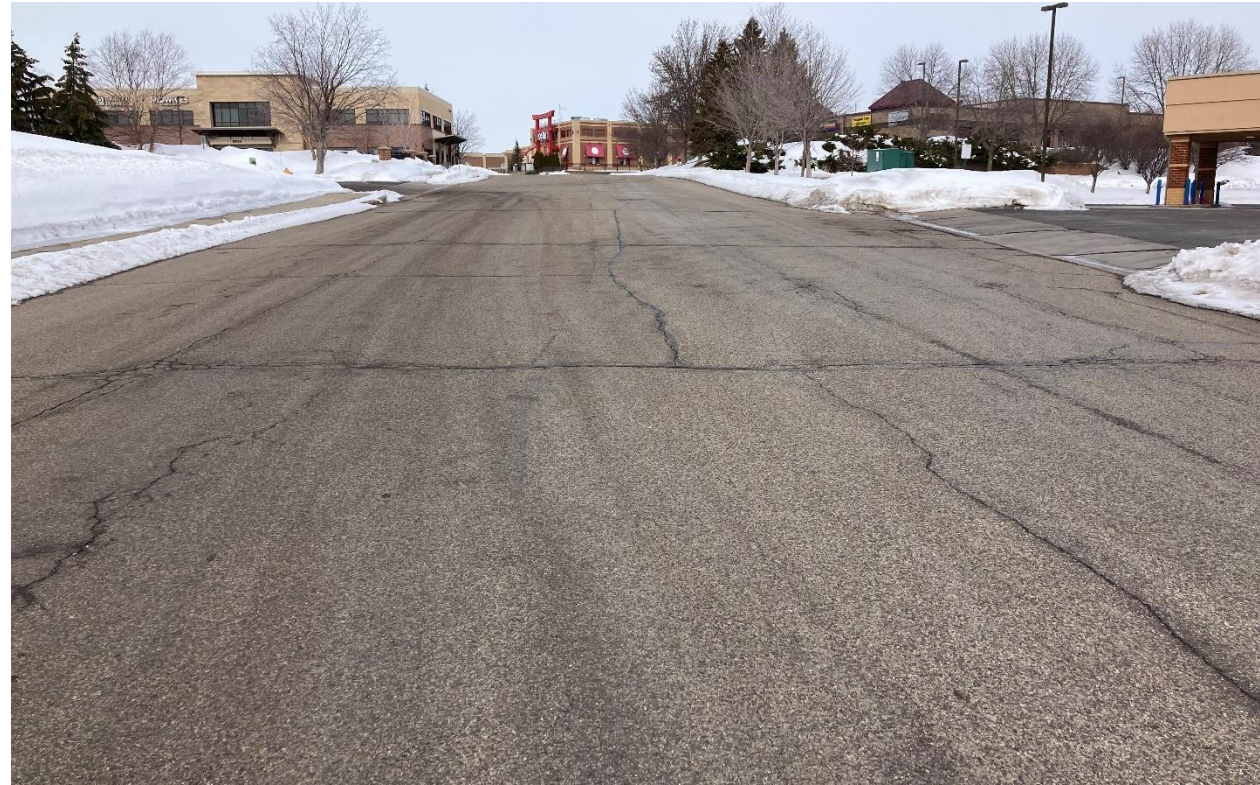
34 th Avenue (west of Plymouth Boulevard)