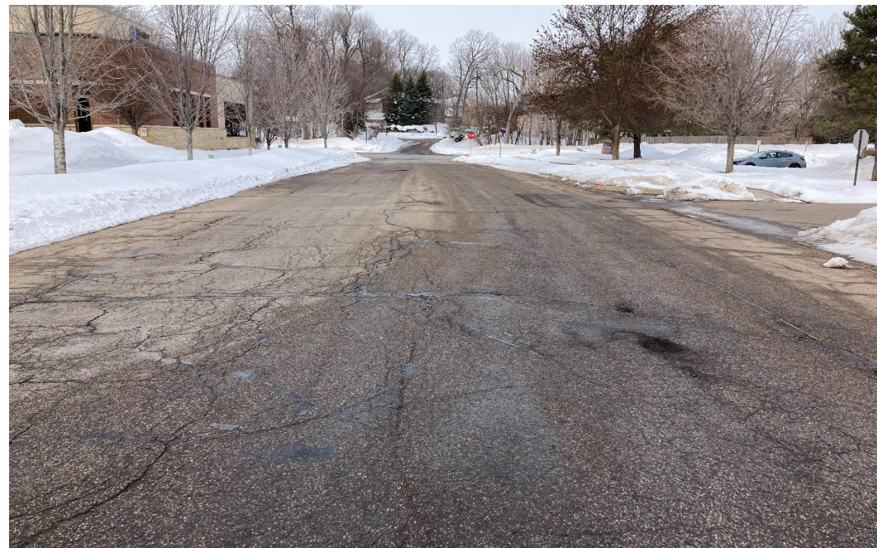
37 th Avenue