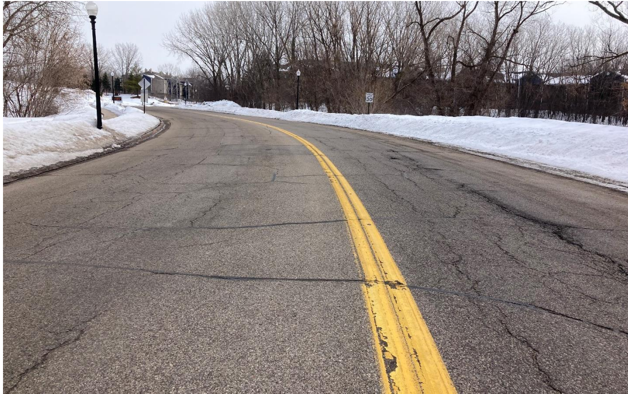
34 th Avenue (west of Plymouth Community Center)