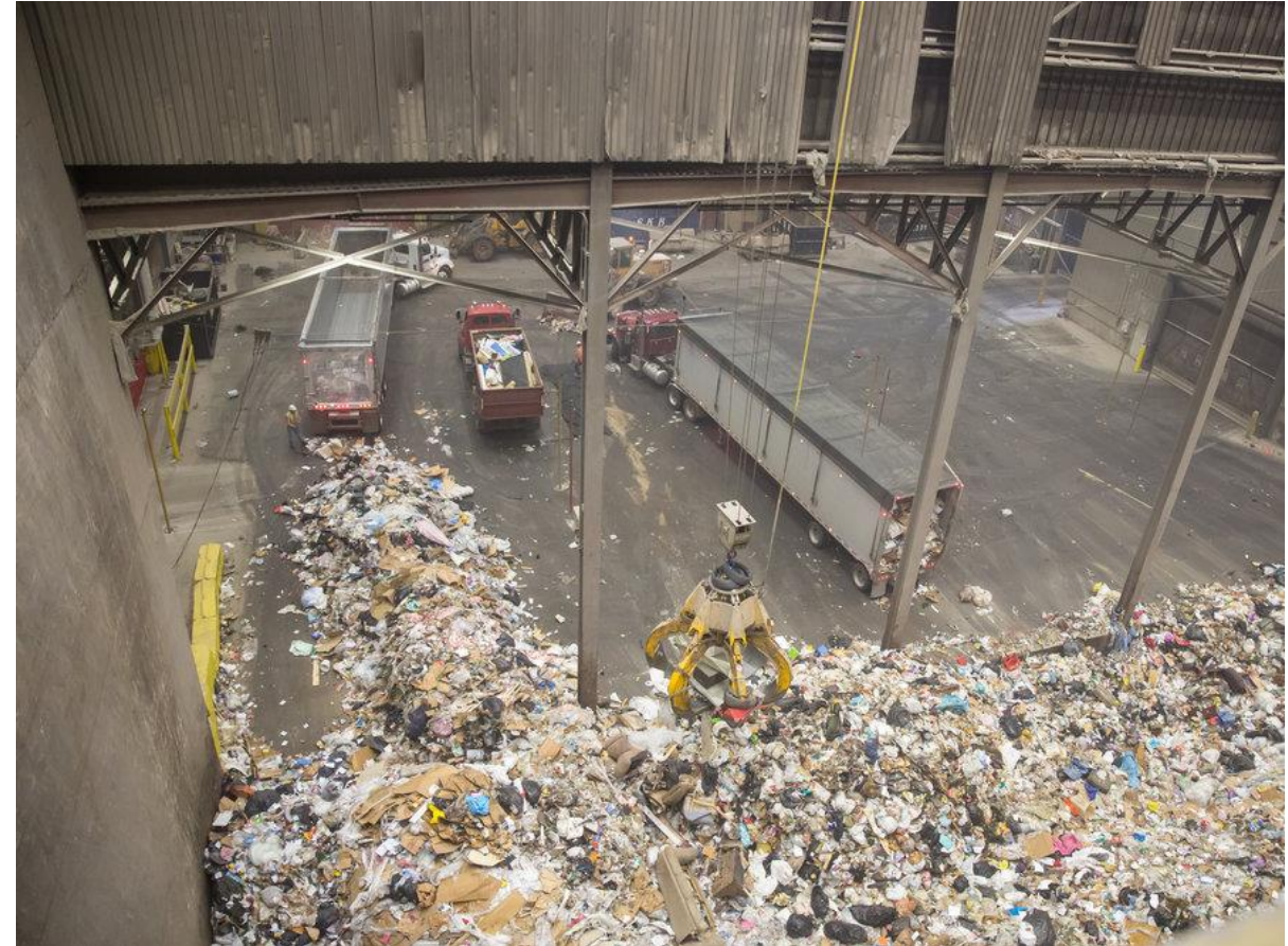
Waste to Energy