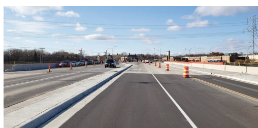
This photo was shared on the city's social media platforms in November as the Rockford Road bridge over I-494 was reaching completion.

In November, the city announced that construction activities were wrapped up for the year at the Rockford Road (County Road 9) and Interstate 494 bridge, which was rebuilt to add capacity in the previously congested area. The new bridge and interchange are fully open to traffic, removing a major bottleneck and improving public safety.