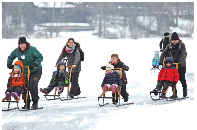
Fire & Ice returns to Parkers Lake on Feb. 1. The annual festival features a variety of wintertime activities, including kick-sled racing (pictured), a youth ice fishing contest, snow bowling, recycle bin races, miniature golf on the ice and more.