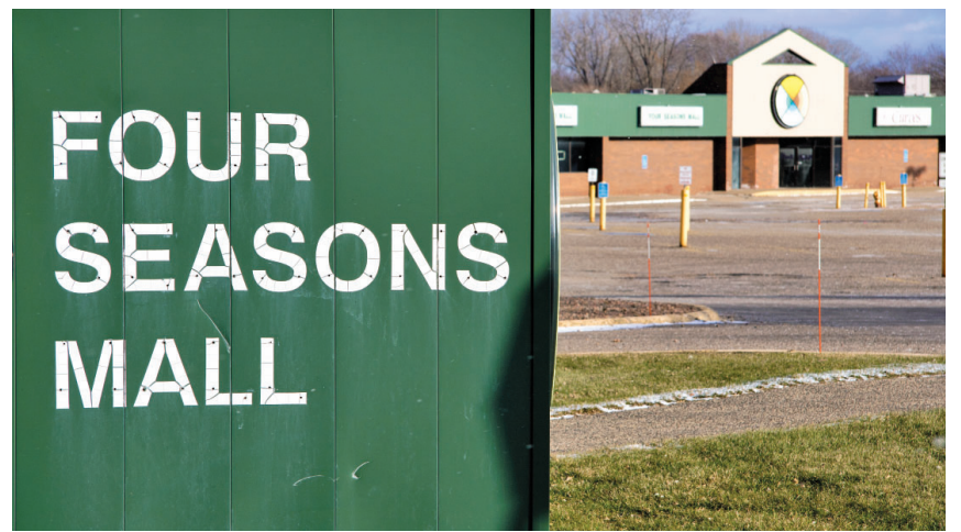
The Four Seasons Mall site has long stood vacant at Rockford Road and Highway 169.

In 2017, the site drew interest by other private developers, but the proposal fell through due to lack of financing, challenging soil conditions and other issues. Traffic in the area has also been a concern for potential development.