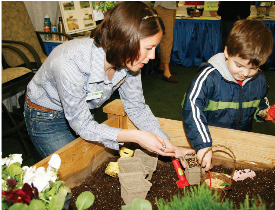
The former Yard & Garden Expo has been expanded and improved to become the Plymouth Home Expo – the first of which will be April 10-11 at the Plymouth Creek Center. The free event will feature educational opportunities, door prizes and more than 100 vendors.

The Home Expo will also feature traditional Yard &